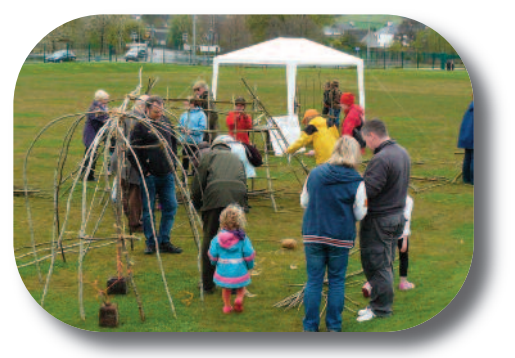
. . . and to build your own home